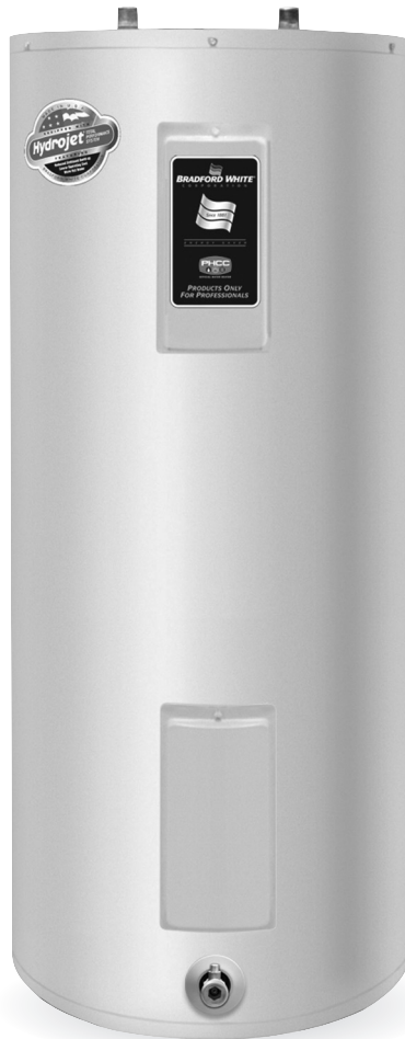
Photo is of M-2-50T6DS